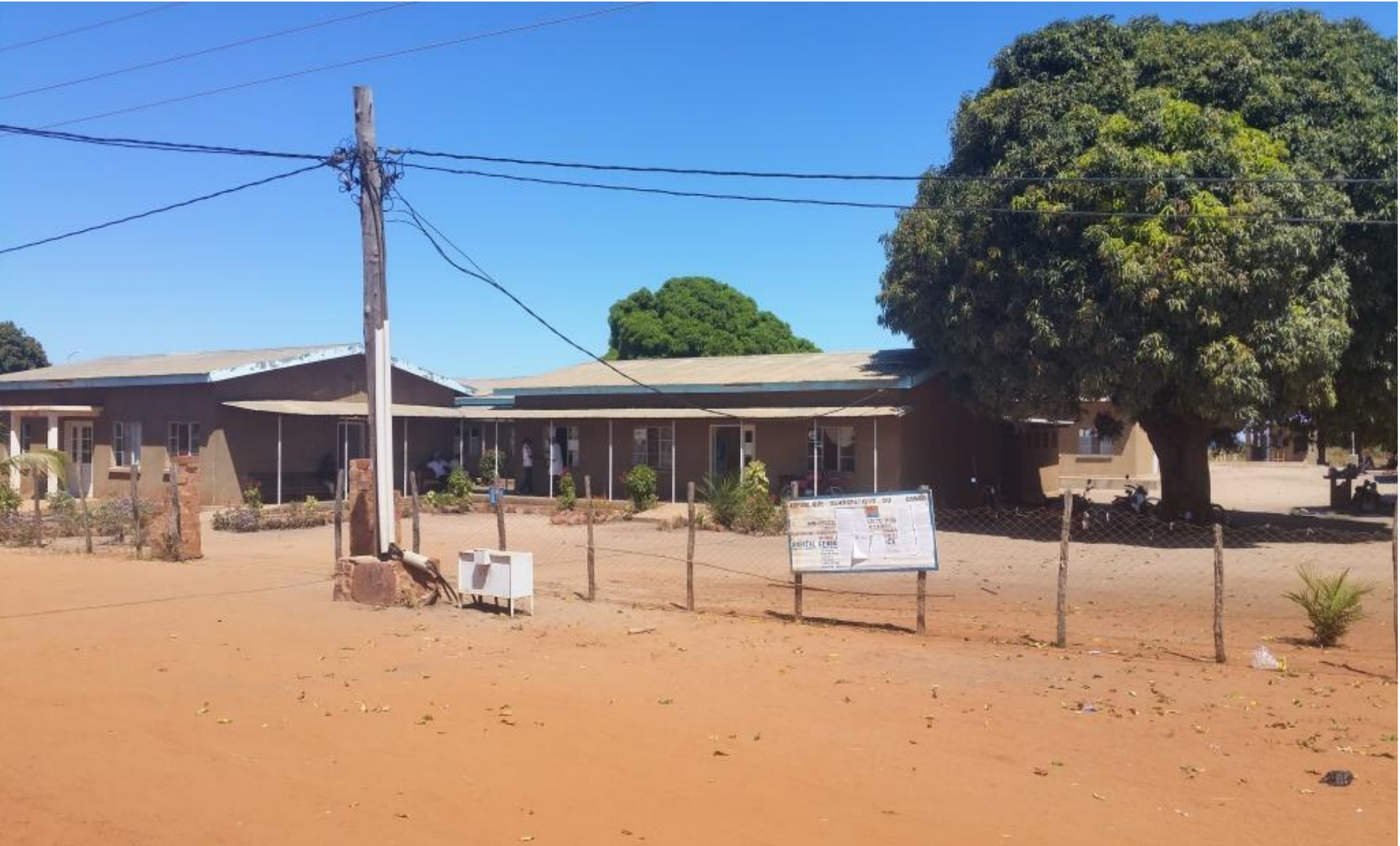
Pweto General Hospital where the Birthing Kits were handled in January 31 st 2017